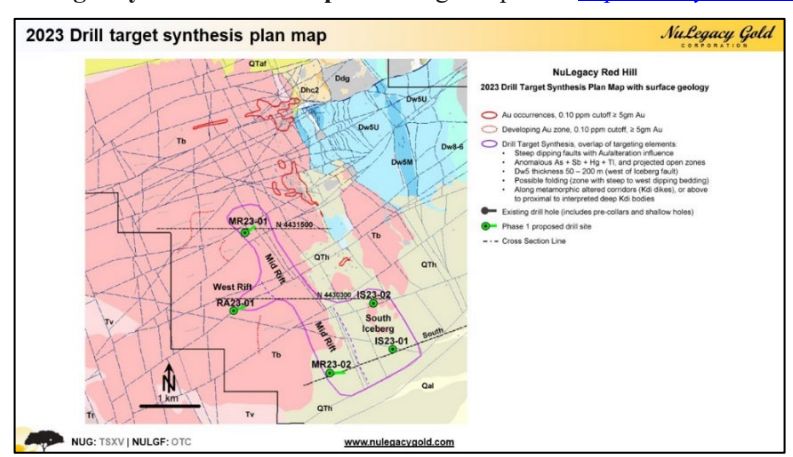
2023 Target Synthesis Plan Map: to enlarge map click <a href="https://bit.ly/2023drilltarget">https://bit.ly/2023drilltarget</a>

Several recommended additional analyses are nearing completion and are corroborating the initial selection of targets; for the general location of the drill targets refer to the map just below; for details please see the <u>drill target plan map & cross-sections</u>.