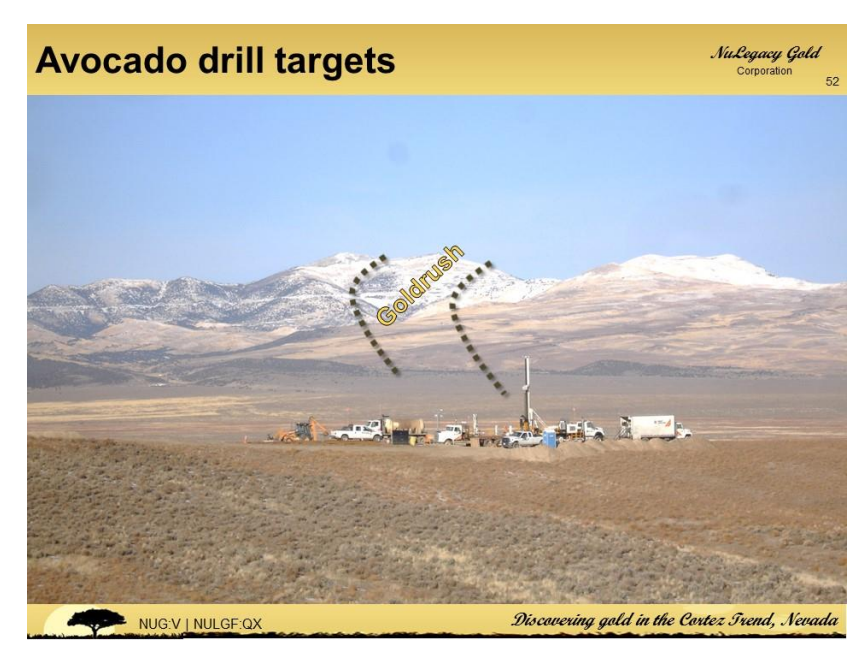
Figure 1- Drilling at the Avocado with the Goldrush deposit in the background.

Drilling has confirmed that there may be a CTDG on the pediment north of Iceberg, and possibility two gold systems. The sum of all data collected to date indicates that mineralization identified in AV-02 and AV04 (core) is open to the north and northwest, into an area of no historic drilling. The initial 2017 program will be to drill at least three reverse circulation holes as step outs to the northwest and north. Two additional holes are planned to the west and north of AV-03 to continue the expansion of this mineralized area. Once the results of this initial 2017 drilling are available and understood, additional drilling will be planned as warranted.